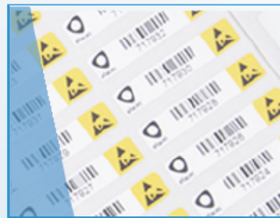
Smallest label height "3mm" support