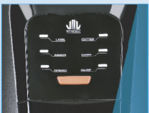
Intuitive display panel