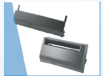
Screwdriver-free installation cutter and peeler