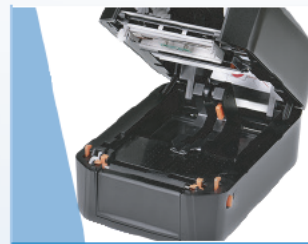
Clamshell double-walled rugged structure