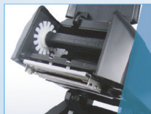
0.5" or 1" core ribbon loading support