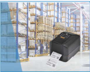
12hr nonstop printing without overheat shutdown