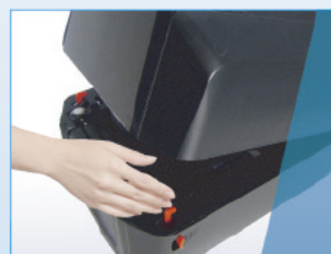
Cover closing safety design