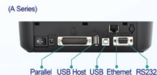
Parallel USB Host USB Ethernet RS232